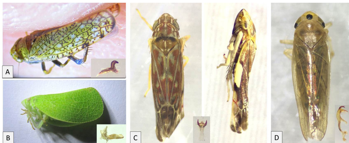
Figure 2. Photographs of alien Auchenorrhyncha species either recorded for the first time in Serbia or confirmed as present: (A) O. ishidiae , aedeagus-lateral view; (B) A. conica , aedeagus-lateral view; (C) E. vulnerata , aedeagus-ventral view and (D) Ph. cyclops , aedeagus-lateral view

12.08.2018; (2) Markovac, along A1 motorway (central Serbia), [44°14'10.6"N 21°07'00.3"E] (EP09), 1♂ swept on Ulmus sp., 27.07.2019; (3) SNR Deliblatska peščara, Kajtasovo, Ludvig polje (Vojvodina, north Serbia) [44°50'27.11"N 21°17'14.33"E] (EQ26), 1♂ 3♀ attracted by a light trap, 29.08.2019.