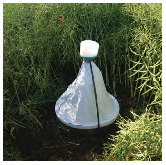
Figure 2. An emergence trap used to monitor the emergence of D. brassicae from the ground

D. brassicae midges developed two generations per year on the trial site and overwintered in the larval stage in cocoons in soil, as they do in most other European countries (Williams et al., 1987; Ferguson et al., 2004;