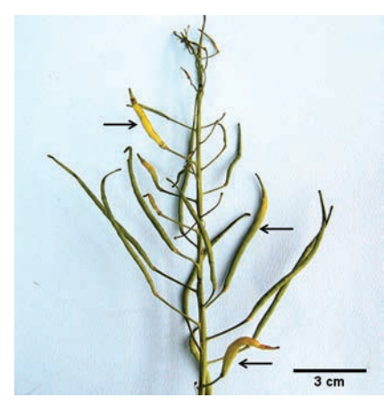
Figure 4. Damaged pods of oilseed rape change their colour, often deforming, drying and cracking

During our examination of infested pods, special attention was paid to detecting damage caused by the cabbage pod weevil Ceutorhynchus assimilis , (syn. C. obstrictus ), which is important for infestation intensity of D. brassicae . In this study, damage caused by that weevil species was not observed. A single larva of C. assimilis was found in the total of 773 examined pods, so the correlation between these two species was not determined. Similar observations had been reported in the Czech Republic (Kazda et al., 2005), while other literature data show that the midge uses openings made by C. assimilis for oviposition (Åhman, 1987; Pavela et al., 2007; Aljmli, 2007; Williams, 2010).