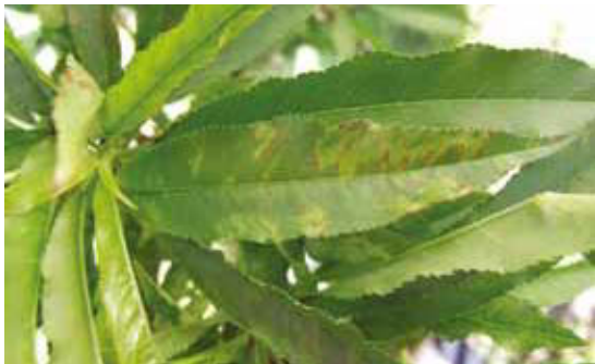
Figure 3. Severe Sharka symptoms on peach leaves