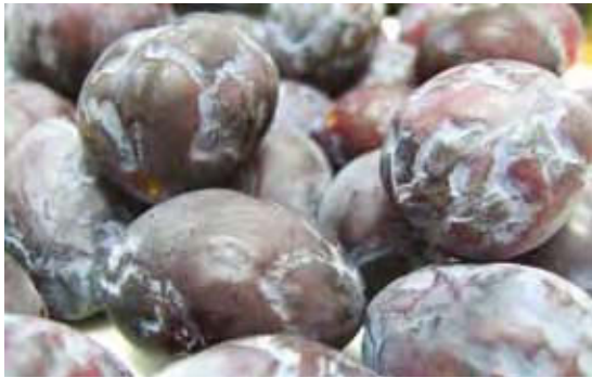
Figure 2. Požegača fruits deformed by Plum pox virus infection