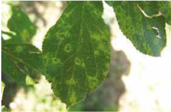
Figure 1. Chlorotic rings, and patterns on plum leaves caused by Plum pox virus