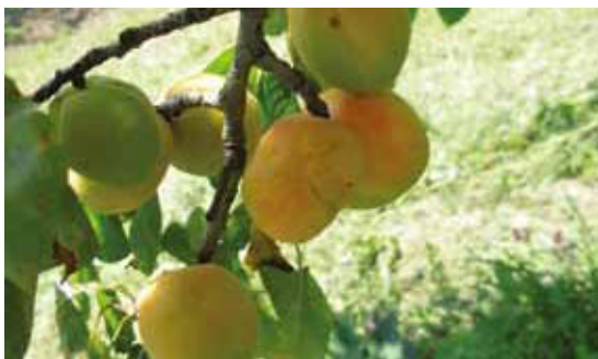
Figure 4. Deformed and bumpy apricot fruits induced by Plum pox virus

Infected Prunus species growing along roads, in hedges and in urban areas are also PPV hosts and usually serve as reservoirs of infection, such as Myrobalan plum ( P. cerasifera Ehrh.) and blackthorn ( P. spinosa L.). The first herbaceous host of PPV, Nicotiana quadrivalvis Pursh., was reported by Sutic (1961). More than 70 herbaceous species from 9 families may be naturally or artificially infected with PPV (Llácer, 2006).