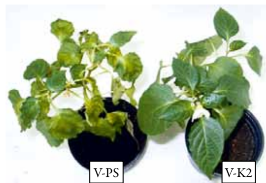
Figure 4. Wilting symptoms on pepper plants 14 days after inoculation V-PS (P. Skela); V-K2 (uninoculated plants)

Table 2 summarizes the results of the disease severity and efficacy of the fungicides and SWC. The results showed a significant difference in the efficacy between SWC (0.5%) (30.36%) and the fungicide carbendazim (69.64%). There was no significant difference between the efficacy of SWC applied at both concentrations.