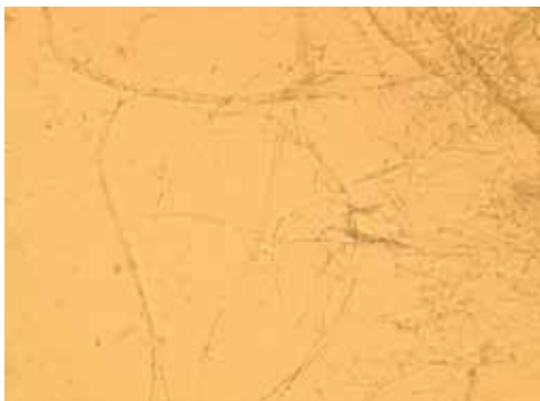
Figure 3. V. dahliae – hyphae, conidiophores and coniclia