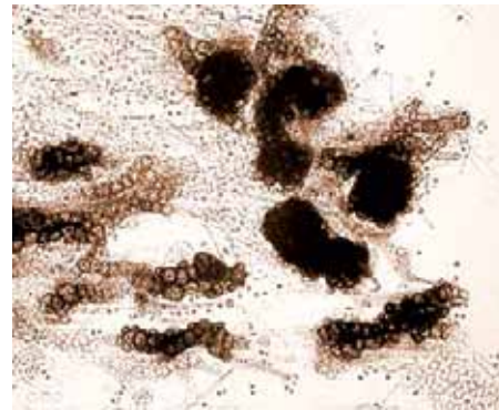
Figure 2. V. dahliae – microsclerotia (40x)